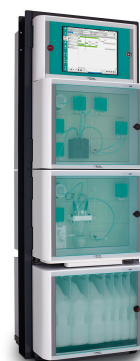
Figure 2. 2060 Process Analyzer from Metrohm for online monitoring of hydrogen peroxide during the CMP process.

Other combinations of measurements, as well as measurement points taken from a single process stream or even multiple streams, can be realized across the Metrohm Process Analytics product portfolio. All platforms guarantee fast, accurate results continuously available for true process control.