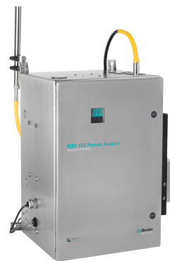
Figure 2. NIRS XDS Process Analyzer from Metrohm Process Analytics.

Wavelength range used: 1100–1650 nm. Inline analysis is possible using a micro interactance reflectance probe with purge on collection tip directly in the fluid bed dryer.