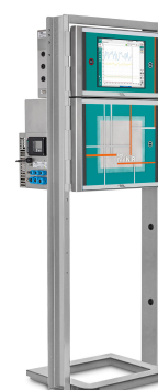
Figure 2. The 2060 The NIR-Ex Analyzer from Metrohm Process Analytics is suitable for use in hazardous areas.

Metrohm Process Analytics manufactures NIRS process analyzers that gather «real-time» spectral data from the process. These are used for comparison to a primary method (e.g., Karl Fischer titration) to create a simple, yet indispensable model to easily monitor QC parameters in near real-time. Gain more control over the refining process with a 2060 The NIR-Ex Analyzer configured for applications in ATEX zones ( Figure 2 ). This process analyzer is capable of monitoring up to five sample points per NIR cabinet with the multiplexer option.