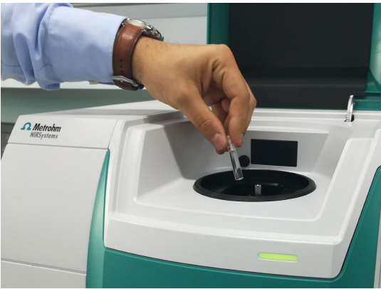
Figure 1. DS2500 Liquid Analyzer and a sample filled in a disposable vial.

Mixtures of ethanol/water standards with a range of ethanol content from 58% to 82% (v/v) were measured in transmission mode with a DS2500 Liquid Analyzer over the full wavelength range (400–2500 nm). Reproducible spectrum acquisition was achieved using the built-in temperature control at 40 °C. For convenience, disposable vials with a path length of 8 mm were used, which made cleaning of the sample vessels unnecessary. The Metrohm software package Vision Air Complete was used for all data acquisition and prediction model development.