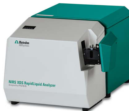
Figure 1. The NIRS XDS RapidLiquid Analyzer with a 1 mm quartz cuvette, used to collect the spectra of surfactant samples.

A total of 37 samples with varying surfactant content were provided by a customer. The Vis-NIR spectra ( Figure 2 ) were acquired on a Metrohm NIRS XDS RapidLiquid Analyzer equipped with 1 mm quartz cuvette ( Figure 1 ). The samples were measured as-is, without any sample preparation steps. Data collection and model development was carried out with the Vision Air complete software package.