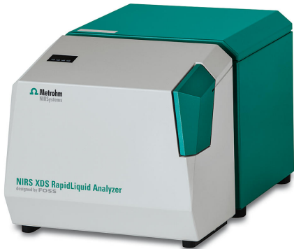
NIRS XDS RapidLiquid Analyzer