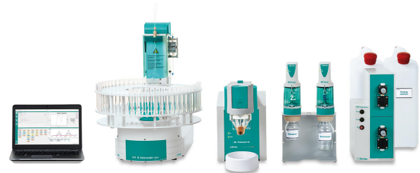
Figure 1. 884 Professional VA, fully automated for voltammetric analysis.

The scTRACE Gold is electrochemically activated prior to the first determination.