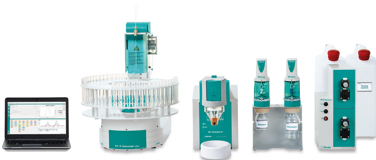
Figure 2. 884 Professional VA, fully automated for VA analysis