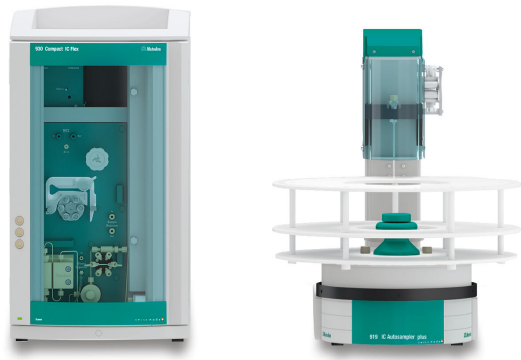
Figure 1. Instrumental setup including a 930 Compact IC Flex with IC Conductivity Detector and a 919 IC Autosampler plus.

The samples were injected directly into the ion chromatograph ( Figure 1 ) without further sample preparation and analyzed using the method parameters given in the USP monograph ( Table 1 ). Anionic components were separated isocratically on a Metrosep A Supp 1 - 250/4.0 column containing the alternative packing material L46. The conductivity signal was detected after sequential suppression.