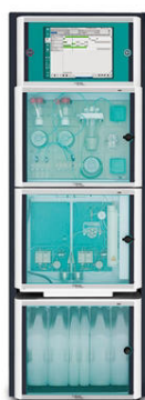
Figure 3. The 2060 IC Process Analyzer is available with either one or two measurement channels, along with integrated liquid handling modules and several automated sample preparation options.