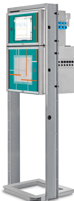
Figure 3. 2060 The NIR Analyzer from Metrohm Process Analytics.