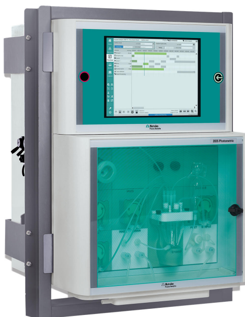
Figure 2. 2035 Process Analyzer - Potentiometric for accurate online determination of ammonia in brine streams.

calculated as ammonia using a 2035 Process Analyzer - Potentiometric ( Figure 2 ).