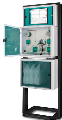
Figure 3. 2060 XRF Process Analyzer.

Incorporating both analysis techniques (i.e., titration/photometry and XRF) in the 2060 XRF Process Analyzer offers users a comprehensive solution for monitoring cyanide levels and metal concentrations in the gold recovery process. This integration enhances plant safety, ensures full recoveries of cyanide from complex solutions, and accelerates return on investment (ROI) by consolidating both methods into one analyzer, thereby reducing footprint and operational costs.