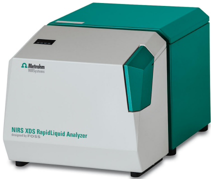
NIRS XDS RapidLiquid Analyzer