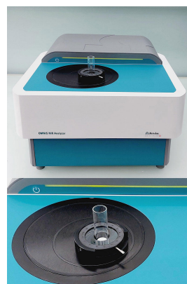
Figure 1. OMNIS NIR Analyzer Solid with 15 mm vial and Flexible holder OMNIS NIR.

In this study, 17 tablets of paracetamol with varying water activity ( 0.23\text{--}0.85\ a_w ) were measured on an OMNIS NIR Analyzer ( Figure 1 ) to create a prediction model for quantification. Samples were measured in reflection mode (1000–2250 nm) in 15 mm vials using a flexible holder and single-point measurement. The reference values were measured according to USP<922> Water Activity [3].