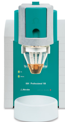
Figure 1. 884 Professional VA.

Sample preparation and the determination of iodine is carried out according to the USP monograph «Thyroid Tablets». The process involves dry ashing of the tablets, where organically bound iodine is released and later converted to iodate. The iodate content is determined with the 884 Professional VA (Figure 1) by differential pulse polarography.