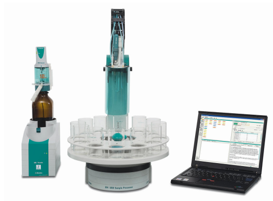
Figure 1. Titrando system consisting of an 814 USB Sample Changer in combination with a 907 Titrando and tiamo.

The blank is determined in the same way, but by omitting the sample.