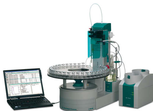
874 Oven Sample Processor 874 Oven Sample Processor · KF