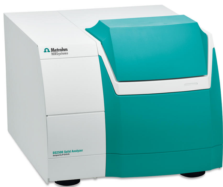
Figure 1. DS2500 Solid Analyzer.