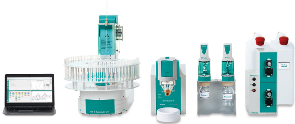
Figure 1. 884 Professional VA fully automated for VA.

Add water, the Ni plating bath sample, and the supporting electrolyte into the measuring vessel. The determination of lead is carried out with the 884 Professional VA (Figure 1) using the parameters specified in Table 1. The concentration is determined by two additions of lead standard addition solution. Activate the Bi drop electrode electrochemically prior to the first determination.