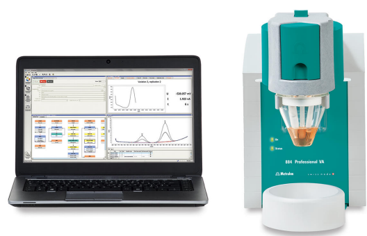
Figure 1. 884 Professional VA

After dissolving and diluting the sample with nitric acid supporting electrolyte, the polarographic determination of Sn(II) is carried out on the 884 Professional VA with the Multi-Mode Electrode pro as working electrode using the parameters listed in Table 1. The concentration of Sn(II) is determined by three additions of Sn(II) standard addition solution.