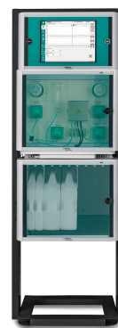
Figure 3. 2060 XRF Process Analyzer for the analysis of CTZ content in white bronze baths.

While XRF enables fast and accurate analysis of total metal content, voltammetry (VA) offers the added advantage of distinguishing free \text{Cu}^{2+} , \text{Zn}^{2+} , and \text{Sn}^{2+} ions, rather than measuring only their total concentrations. Distinguishing between these species is particularly important for monitoring the \text{Sn(II)}/\text{Sn(IV)} balance which is crucial for bath stability and plating performance. It also ensures that metal ion availability supports optimal deposition rates and bath efficiency.