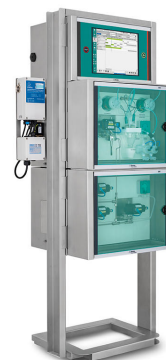
Figure 2. A 2060 TI Ex Proof Process Analyzer, one of the Metrohm Process Analytics stainless-steel process analyzers.

While laboratory methods are time-consuming and require skilled technicians, online monitoring with process analyzers offers rapid results with minimal personnel oversight. Furthermore, positioning the analyzer within clean rooms minimizes contamination risks, which ensures greater reliability and efficiency. Metrohm process analyzers can handle peracetic acid samples with or without the presence of surfactants. They also degas samples before analysis to prevent bubble formation from H 2 O 2 that directly interferes with the measurement. In this industry, preventing cross-contamination is essential; therefore, a stainless-steel process analyzer (Figure 2) is recommended to maintain a sanitary environment and ensure reliable monitoring of PAA in cleaning solutions.