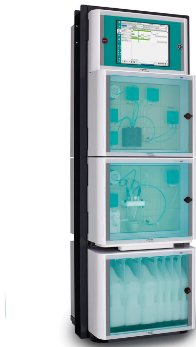
Figure 2. 2060 TI Process Analyzer for the online analysis of critical quality parameters in pickling baths using the method of titration.

Metrohm Process Analytics offers a multi-parameter process analyzer that is suitable for the simultaneous analysis of \text{Fe}^{2+}/\text{Fe}^{3+} and free acid/total acid ratio over a wide concentration range—the 2060 TI Process Analyzer (Figure 2).