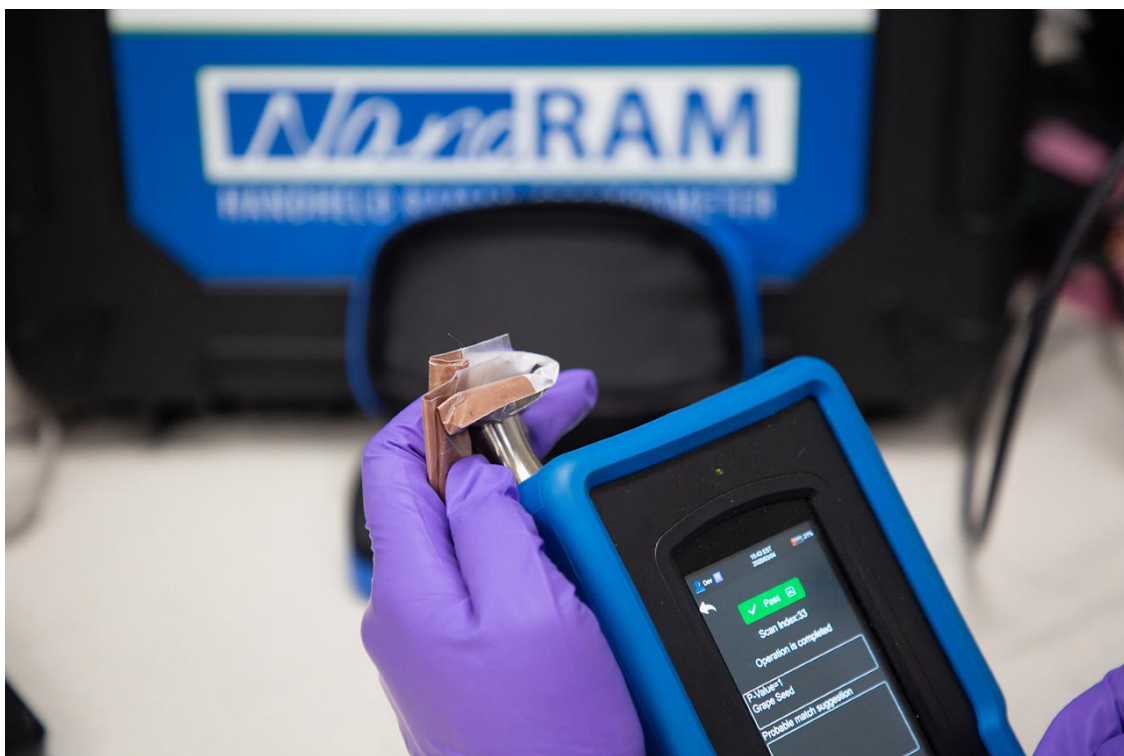
Figure 2. Analyzing grape seed extract with 1064 nm laser with point and shoot adapter.

darker colored samples. For this case study the NanoRam-1064 Identification mode was utilized because it provides a robust algorithm based on a multivariate method. For each botanical sample an individual method was created. To create a method each sample was scanned five different times in alternate spots. All samples were tested against each method to prove validity.