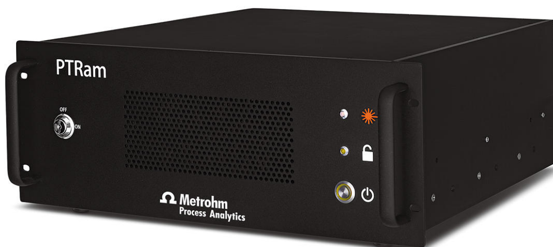
Figure 1. The PTRam Analyzer from Metrohm Process Analytics.

There is minimal space available to install an analysis system within the wet bench area ( Figure 2a ). Therefore, the PTRam Analyzer is the ideal solution for restricted spaces due to its small dimensions. Thanks to the embedded IMPACT software and the variety of industrial communication protocols, results can be