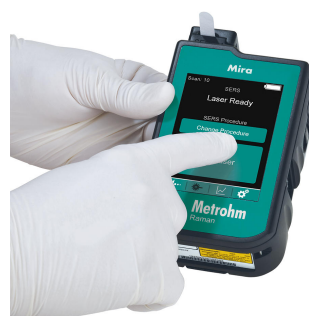
Figure 1. SERS is easily implemented on any 785 nm Raman instrument with dedicated substrates. Metrohm's MIRA XTR and P-SERS substrates are a convenient, portable, and sensitive solution.

enhanced signal exceeds the sensitivity of standard Raman techniques and enables rapid identification and quantification of trace amounts of chemicals. Additionally, SERS requires minimal training, it uses very small sample volumes (typically less than 20 L), and it improves safety by minimizing exposure risks and waste disposal concerns.