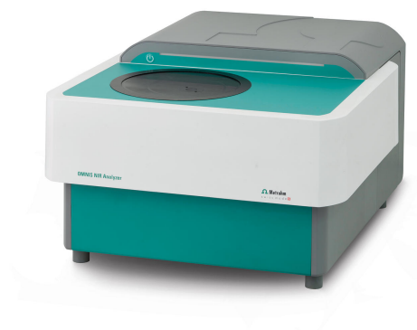
Figure 1. The OMNIS NIR Analyzer Solid from Metrohm.

In this study, 10 textile samples of varying cotton and polyester composition were analyzed with NIR spectroscopy to create a prediction model for quantification of cotton content. Samples were analyzed on a NIR spectrometer (OMNIS NIR Analyzer Solid, Figure 1 ) in reflection mode (1000–2250 nm) using a large lid and no holder to ensure that the textile samples were evenly pressed against the measurement window. Multi-point measurement was selected as the measuring mode. Data acquisition and prediction model development were performed with OMNIS software.