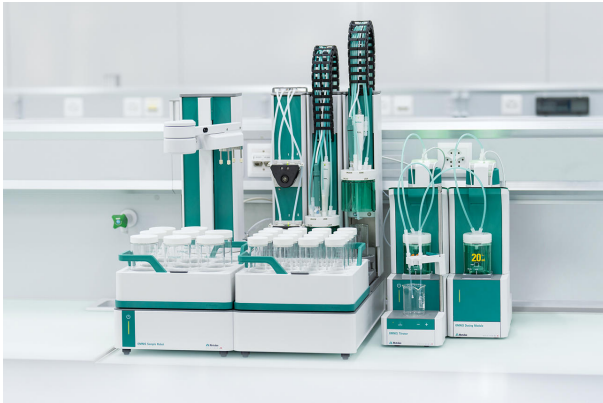
Figure 1. OMNIS Sample Robot S equipped with an OMNIS Titrator, OMNIS Dosing Module, and dSolvotrode for the automated determination of TAN and TBN in motor oil samples.

The determinations are carried out using an OMNIS Professional Titrator equipped with a dSolvotrode on an OMNIS Sample Robot S (Figure 1). To avoid manually handling chemicals, all solutions can be automatically added using an OMNIS Dosing Module. An appropriate amount of sample is weighed into the titration vessel and solvent is added. Afterwards, the solution is titrated until after the first endpoint with standardized potassium hydroxide for the total acid number, or with standardized perchloric acid in acetic acid for the total base number. One exemplary titration curve of TBN with \text{HClO}_4 is shown in Figure 2.