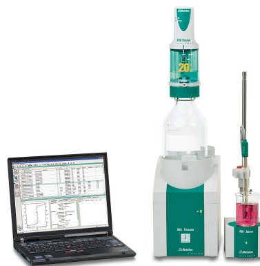
Figure 1. Titration system consisting of a 907 instrument in combination with tiamo.

The analyses are carried out using a 907 Titrand equipped with a Solvotrode easyClean. An aliquot of the extraction solution is transferred to a beaker, filled up with ethanol (in order to immerse the glass membrane and diaphragm of the electrode), and then titrated with standardized perchloric acid in glacial acetic acid until after the first equivalence point is reached.