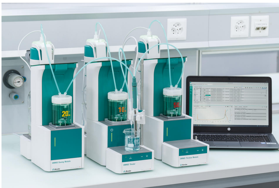
Figure 2. OMNIS Titrator equipped with a dPt Titrode electrode for the determination of caffeine content in aqueous samples.