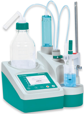
Figure 1. Eco Titrator equipped with an Ag Titrode.

The determinations are carried out on an Eco Titrator equipped with an Ag Titrode and a Polytron for sample preparation. An appropriate amount of sample is weighed into the sample beaker and CO 2 -free water as well as nitric acid solution is added. While stirring, the solution is titrated until after the first equivalence point with standardized silver nitrate solution.