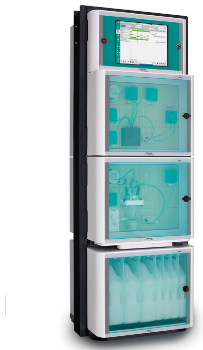
Figure 2. 2060 TI Process Analyzer used for online monitoring of hydrogen peroxide in salmon delousing baths.