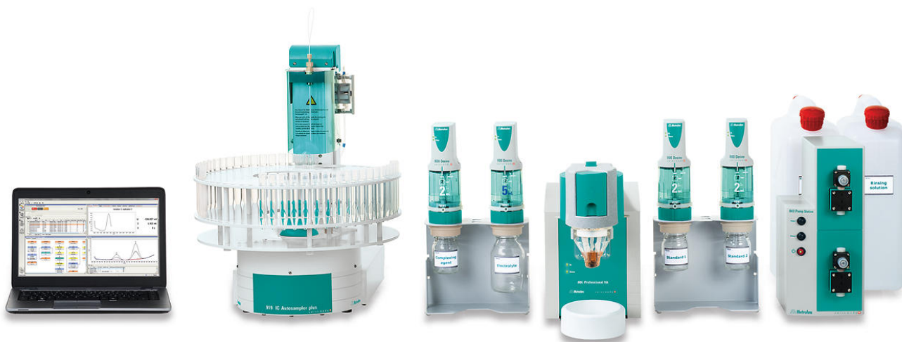
Figure 2. 884 Professional VA fully automated for VA