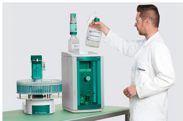
Figure 1. Compact, user-friendly Metrohm IC instrumentation to quantify various anions in explosives and explosion residues.

Sequential suppression, including chemical and CO 2 -suppression, reduces the background conductivity to around 1 µS/cm and vastly improves the signal-to-noise ratio. All anions are determined with a conductivity detector and quantified with the MagIC Net software.