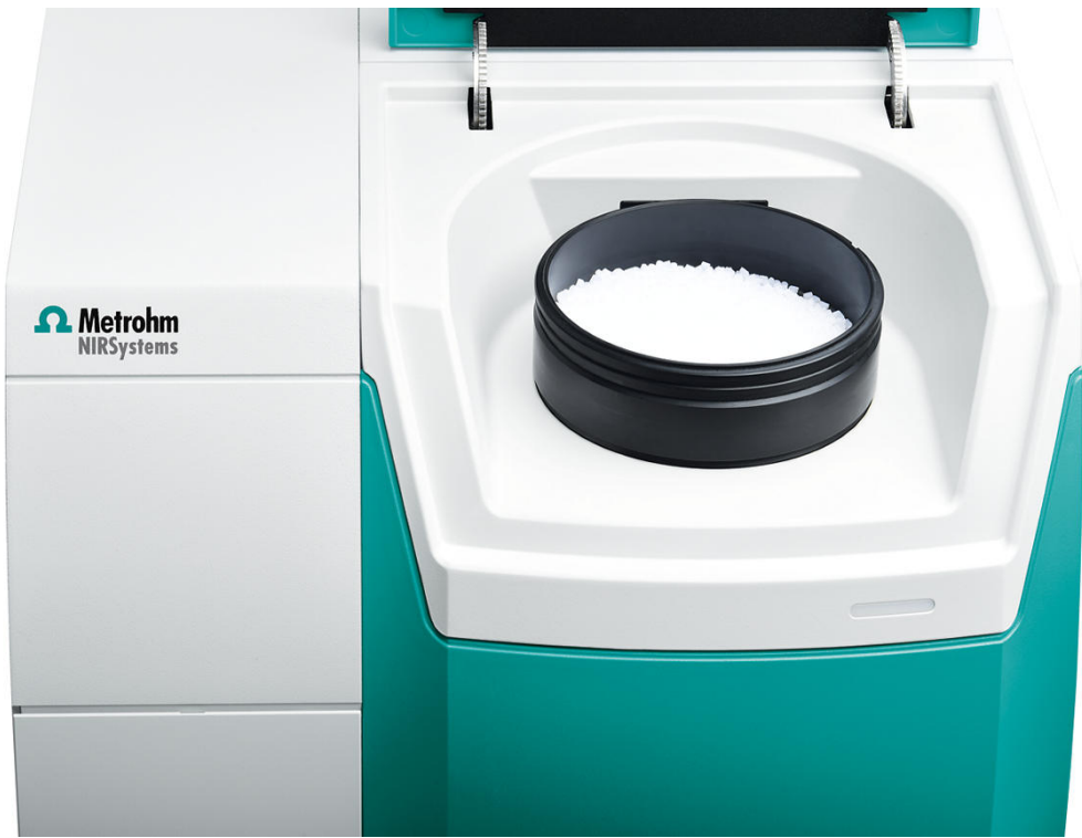
Figure 1. Metrohm DS2500 Solid Analyzer with the DS2500 large sample cup for measuring the intrinsic viscosity of recycled polyethylene terephthalate (rPET).

spectra. This setup with the large sample cup reduces the influence of the particle size distribution of the polymer pellets ( Figure 1 ). Data acquisition and prediction model development was performed with the software package Vision Air Complete.