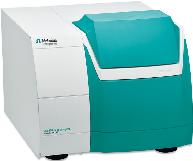
Figure 1. DS2500 Solid Analyzer.