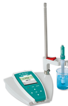
Figure 1. 913 pH Meter equipped with a pH electrode. Example setup for the determination of the pHe value.

A defined amount of sample is poured into a 100 mL beaker and placed on an external stirring plate. The EtOH Trode and the temperature sensor are immersed, and the measurement is started immediately. The value after 30 seconds is considered to be the acid strength of the sample.