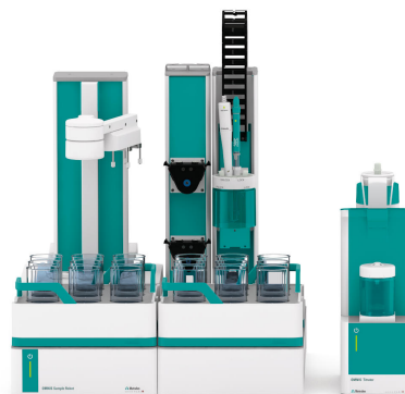
Figure 1. OMNIS System consisting of an OMNIS Sample Robot S and an OMNIS Advanced Titrator.

The sample solution is transferred into a sample beaker and deionized water is added. The solution is titrated with standardized sodium hydroxide until after the second equivalence point. After each titration, the solution is aspirated and the electrode is then rinsed with deionized water.