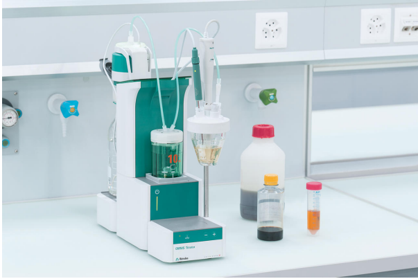
Figure 1. OMNIS Titrator setup for the thermometric titration. Data evaluation is performed with the OMNIS software.

An appropriate amount of sample is weighed precisely into the titration vessel. Deionized water is added to dissolve the sample, which is then titrated until after the exothermic endpoint with standardized STPB.