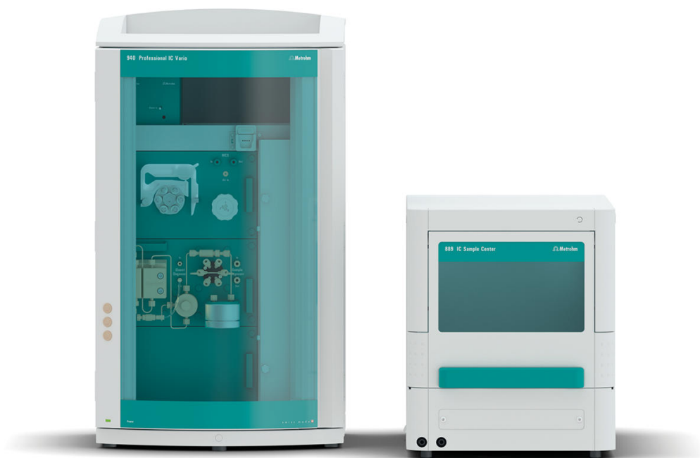
Figure 1. Instrumental setup including a 940 Professional IC Vario ONE/SeS/PP, IC Conductivity Detector (L) and the 889 IC Sample Center (R).

subsequently analyzed with a 940 Professional IC Vario using the method parameters given in the respective USP monograph ( Table 1 ).