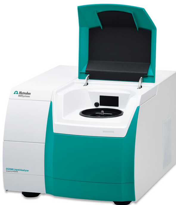
Figure 1. Metrohm NIRS DS2500 Liquid Analyzer used for the measurement of iodine value in soybean-palm oil blends.

The measured Vis-NIR spectra ( Figure 2 ) were used to create a prediction model for quantification of iodine value. The performance of the prediction models was evaluated using correlation diagrams which display a very high correlation ( R^2 > 0.999 ) between the Vis-NIR