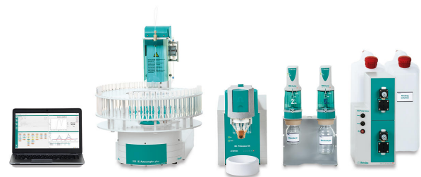
Figure 1. 884 Professional VA, fully automated for voltammetric analysis.

The scTRACE Gold is electrochemically activated prior to the first determination.