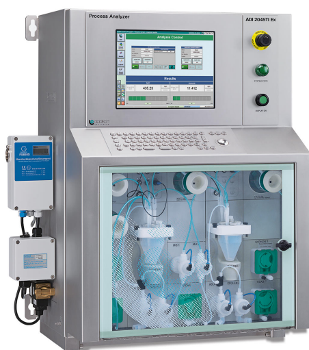
Figure 2. The 2045TI Ex proof Process Analyzer is certified for Zone 1 and Zone 2 areas.

The Metrohm Process Analytics 2045TI Ex proof Process Analyzer (Figure 2) with a customized sample preconditioning system could be implemented in many areas within a refinery to ensure that catalysts in the reactors are not exhausted and to limit corrosion further on in the distillation unit. The analyzer fulfills EU Directives 94/9/EC (ATEX95) and is certified for Zone 1 and Zone 2 areas.