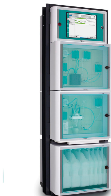
Figure 2. 2060 TI Process Analyzer for the online analysis of critical quality parameters in pickling baths using the method of titration.

Metrohm Process Analytics offers a multi-parameter process analyzer that is suitable for the simultaneous analysis of \text{Fe}^{2+}/\text{Fe}^{3+} and free acid/total acid ratio over a wide concentration range—the 2060 TI Process Analyzer (Figure 2).