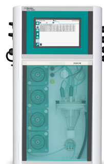
Figure 4. The 2026 HD Titrolyzer from Metrohm Process Analytics can monitor up to two critical parameters online in the anodizing process.

Aluminum is also an ideal material for other surface treatment applications. It can be cleaned using acid pickling processes to ensure complete passivation. A pickling process is also used to prepare the aluminum for applying a conversion coating as a protective surface layer.