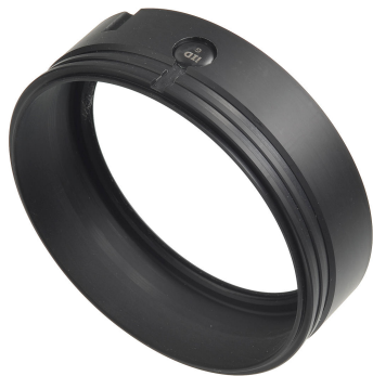
DS2500 NIRS DS2500 Analyzer

DS2500 AnalyzerDS2500 Analyzer DS2500400 ~ 2500 nm1DS2500 Analyzer 9MultiSample Cup