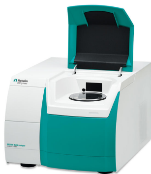
DS2500 Solid Analyzer

DS2500 AnalyzerDS2500 Analyzer DS2500400 ~ 2500 nm1DS2500 Analyzer 9MultiSample Cup