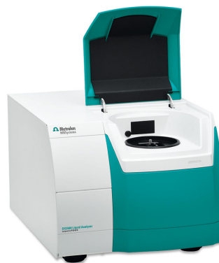
Figure 1. DS2500 Liquid Analyzer.

23 marine cylinder lubricants and 37 engine lubricants were analyzed on a Metrohm DS2500 Liquid Analyzer equipped with 2.5 mm flow cell. All measurements were performed in transmission mode from 400 nm to 2500 nm. In this feasibility study, a flow cell was used to automate the sample handling and measurement. Data acquisition and prediction model development was performed with the software package Vision Air complete.