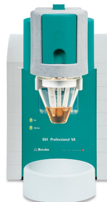
Figure 1. 884 Professional VA.

Sample preparation and the determination of iodine is carried out according to the USP monograph «Thyroid Tablets». The process involves dry ashing of the tablets, where organically bound iodine is released and later converted to iodate. The iodate content is determined with the 884 Professional VA (Figure 1) by differential pulse polarography.