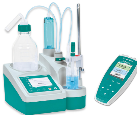
Figure 1. Eco Titrator and a 913 pH Meter with a maintenance-free Ecotrode Gel with NTC.

For the TTA measurement, the solution is titrated until after the first equivalence point with standardized sodium hydroxide solution is reached.