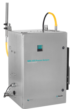
Figure 2. NIRS XDS Process Analyzer from Metrohm Process Analytics.

Wavelength range used: 1100–1650 nm. Inline analysis is possible using a micro interactance reflectance probe with purge on collection tip directly in the fluid bed dryer.